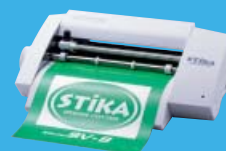
Model SV-8 160mm (8") Cutter