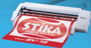
Model SV-15 340mm (15") Cutter

Create Colorful Custom Graphics with Ease